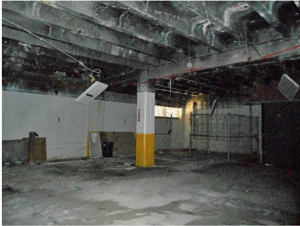
VIEW A: EXISTING PARKING GARAGE AT GROUND LEVEL LOOKING AT NW CORNER