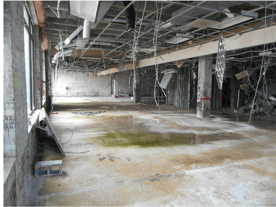
VIEW B: EXISTING SECOND FLOOR FROM NW CORNER LOOKING SE