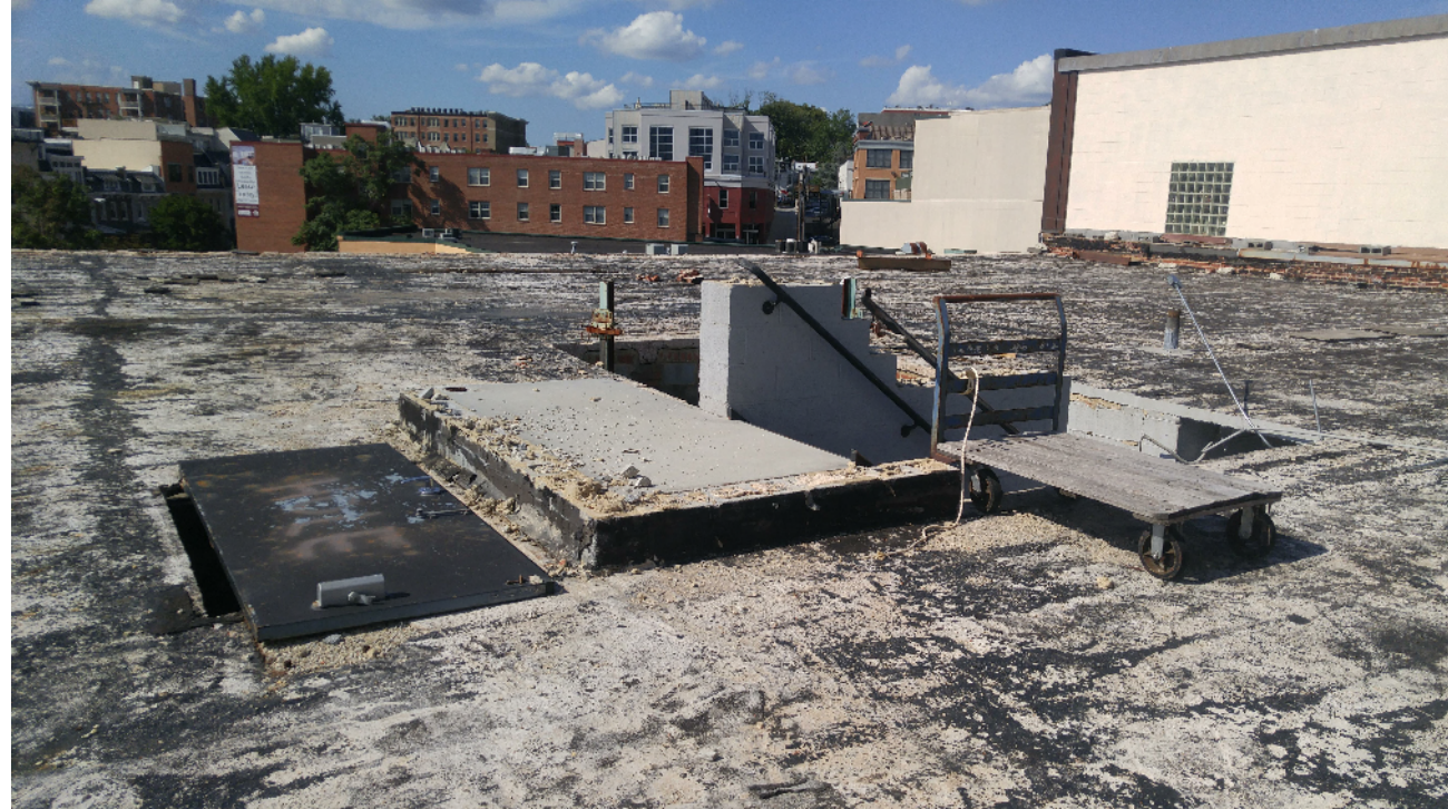
VIEW D: PARKING GARAGE AT GROUND LEVEL