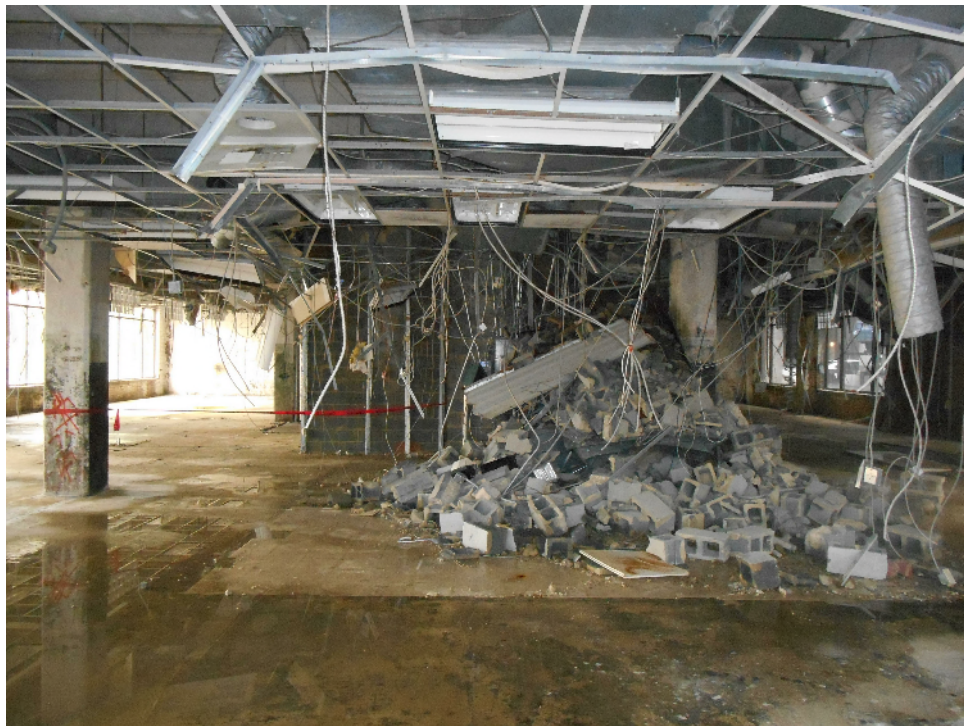
VIEW C: EXISTING CONDITIONS OF THIRD FLOOR FROM WEST LOOKING EAST